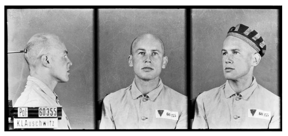
Auschwitz prisoner Hermann Langbein, ca. 1940.